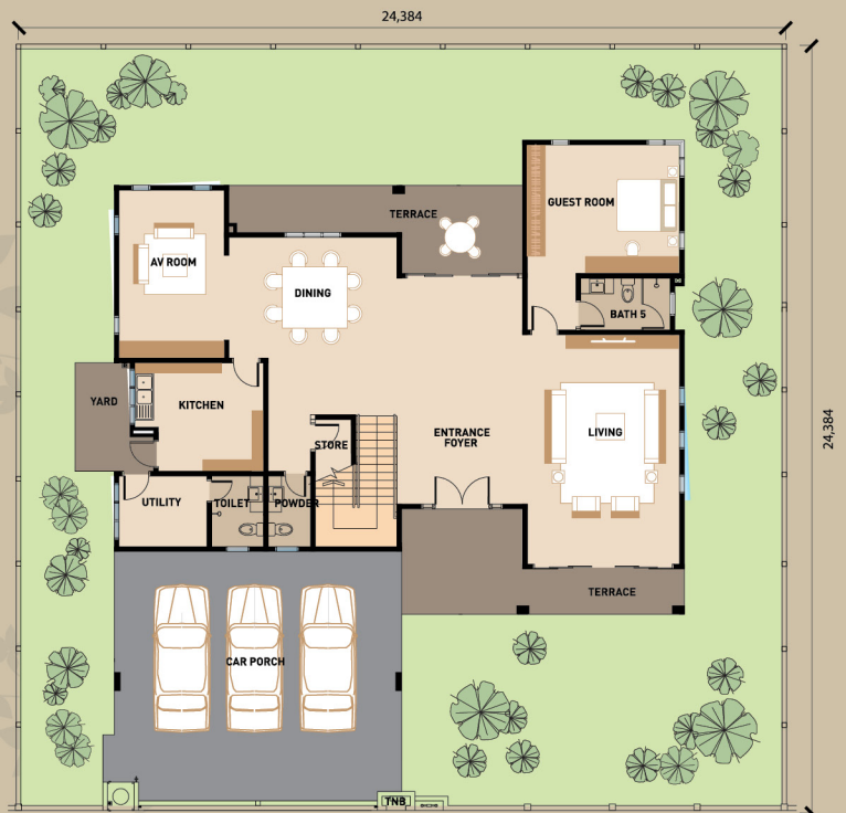
GROUND FLOOR PLAN BUNGALOW TYPE C