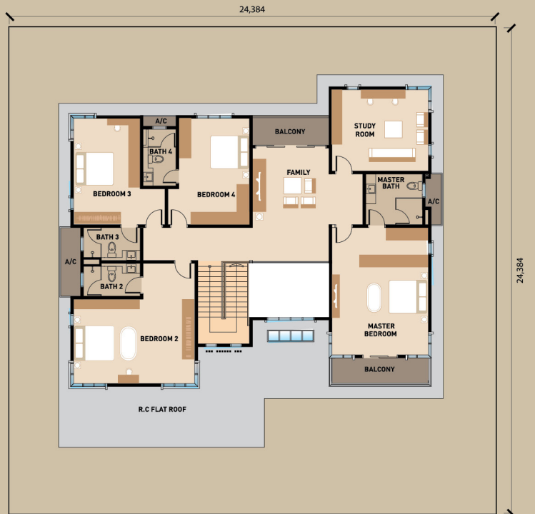
FIRST FLOOR PLAN BUNGALOW TYPE C