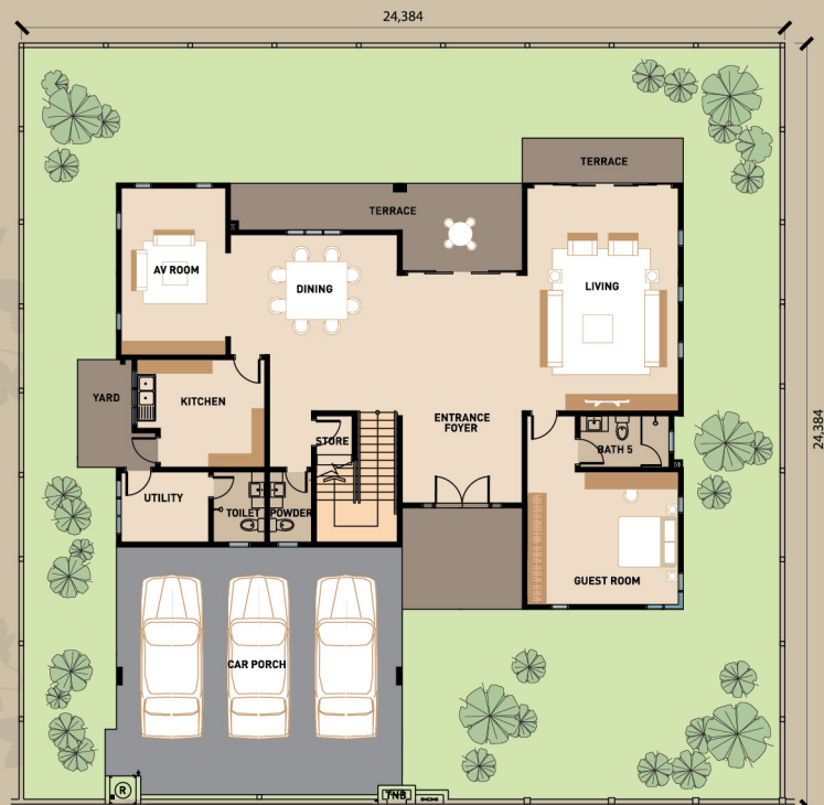
GROUND FLOOR PLAN BUNGALOW TYPE D