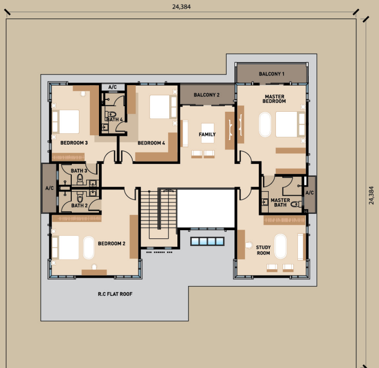
FIRST FLOOR PLAN BUNGALOW TYPE D